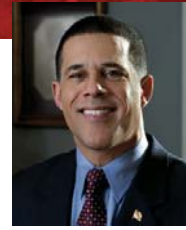
Anthony G. Brown Lt. Governor

PREPARE YOURSELF FOR A BRIGHTER FUTURE With a competitive job market, and new and emerging technologies, many employers are requiring new skills to succeed.