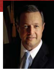
Martin O'Malley Governor